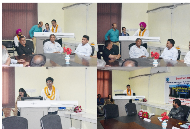
Felicitations of students on achieving various positions in University Examination held by RAJUVAS, Bikaner (Raj.)